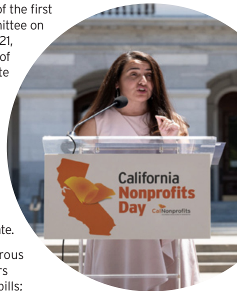
Senator Monique Limón

We also testified at numerous hearings; submitted letters in support of an array of bills; mobilized nonprofit workers with student debt to provide comment on needed changes to the Public Service Loan Forgiveness program, and so much more.